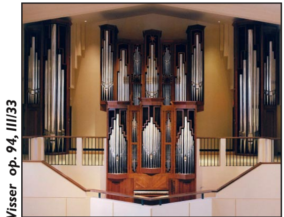
Visser op. 94, III/33