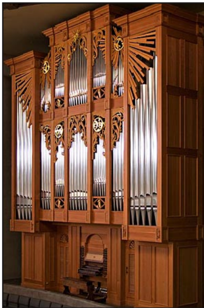
Richards, Fowkes & Co. op. 14, III/72