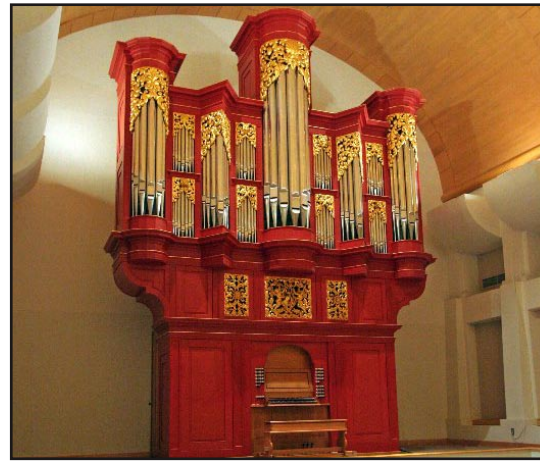
Fitts op. 12, III/29