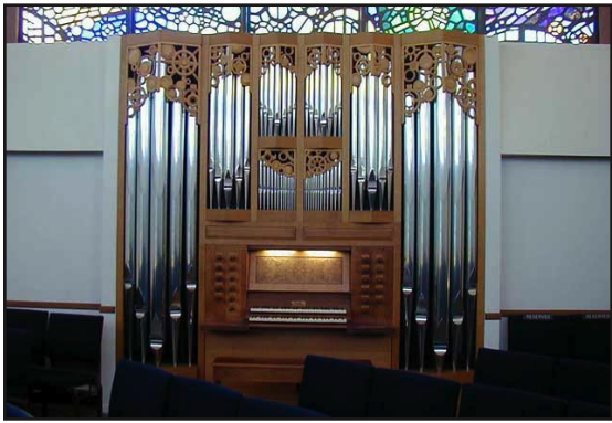
Rosales op. 12, III/16